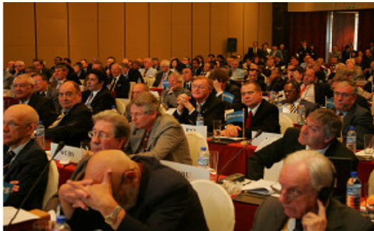
Oh No ! Not that IDBF lot again !! The GAISF General Assembly in session – 27 April 2007, Beijing, China.

Well, did the ICF President get it right or was he just being a little economical with the truth ? Judge for yourself as you read the full Minute concerning the ICF objection, the debate that followed, what the GAISF President and the GAISF Members actually said and the decision by the GAISF Members and what it really means.