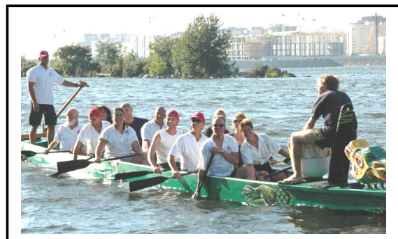
Race officials unwind after the championship with a friendly race, The "IDBF Allstars" in a relaxed mood on Sunday evening

The Open Premier 2000m was won by Moscow Masters in 9.03.73 , with Shtoorm an extremely close second place in 9.03.93 and Moravian Dragons third, in 9.09.18, followed by Uzho-Ural University (Rus); Kiev (Ukr), Wann-see Dragons (Ger; Ukermark (Ger); St Petersburg (Rus) and Club Adventure (Pol). Moscow Dragons took Gold in the Senior Open in 9.22.56, followed by Oksmoki in 9.26.36 and Master Chaykovskiy in 9.26.64. Victorya won the Junior Open in 10.00.92, with Volga Dragons in second in 10.39.21.