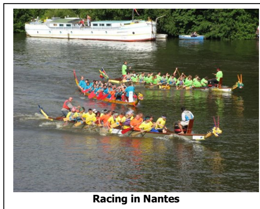
Racing in Nantes