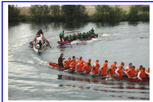
Tight on the Turn – Open 2000m

The Senior Medals were a little more spread out with Pskov (Rus) taking Gold in the Senior Mixed, followed by Elb Meadow (Ger) and Raba Aqua (Hun) taking Bronze. In the Senior Open 200m Moscow Dragons took the title in 0.46.29, with Oksmoki (Pol) winning Silver (0.47.33) and Master Chaykovskiy (Rus) the Bronze in 0.47.87.